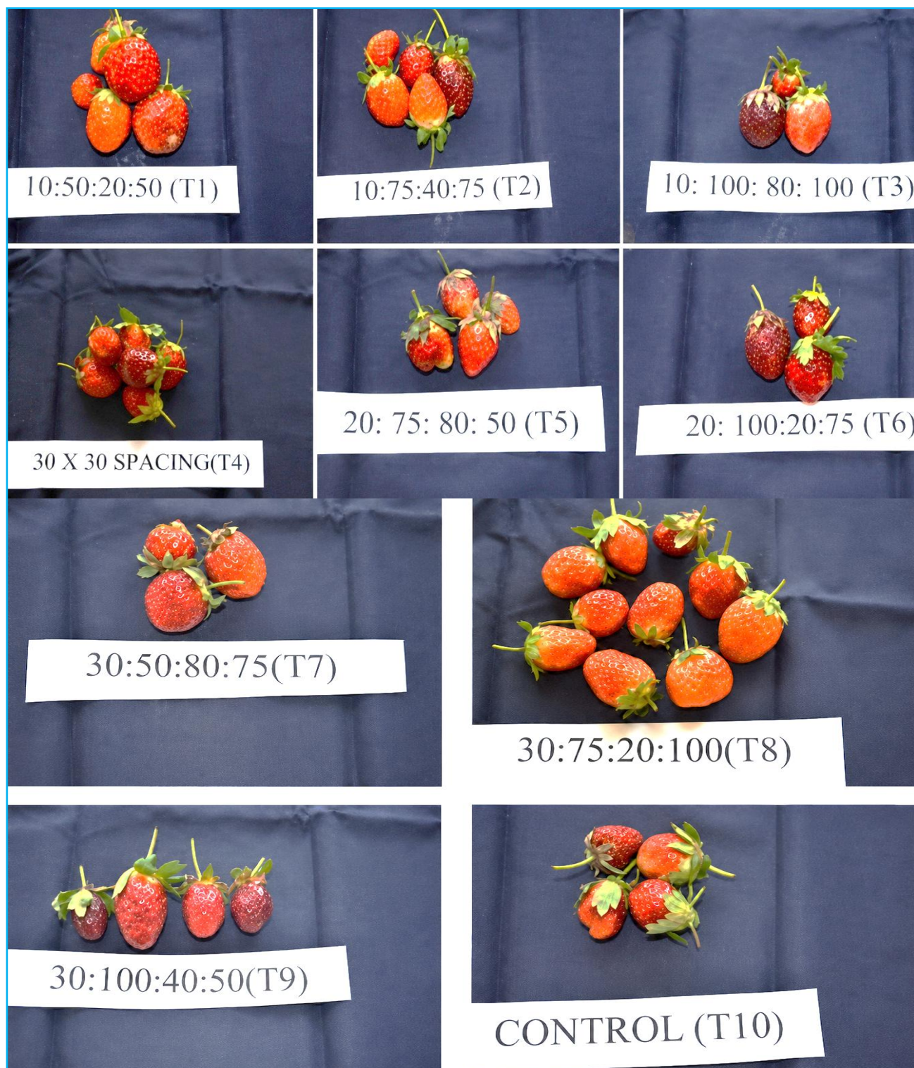
Fig 2 Strawberry fruits obtained from different nutrient combinations

sugars and ascorbic acid content in fruits may be due to the combined effect of higher doses of FYM and nitrogen in the fertilizer application. These findings are in agreement with the observations of Odongo et al. [24]; Wani et al. [7], Arjun [9].